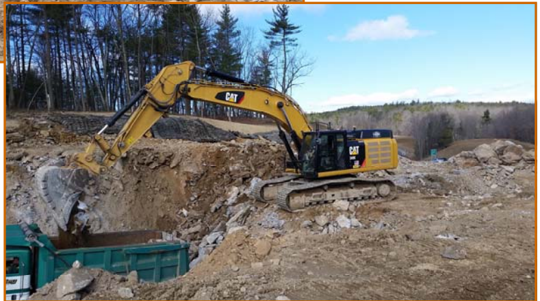
RIGHT: LOADING ROCK