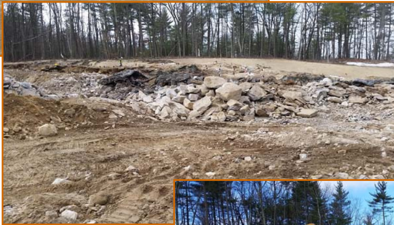
BELOW, MIDDLE: LOOKING AT LAST AREA TO BE BLASTED