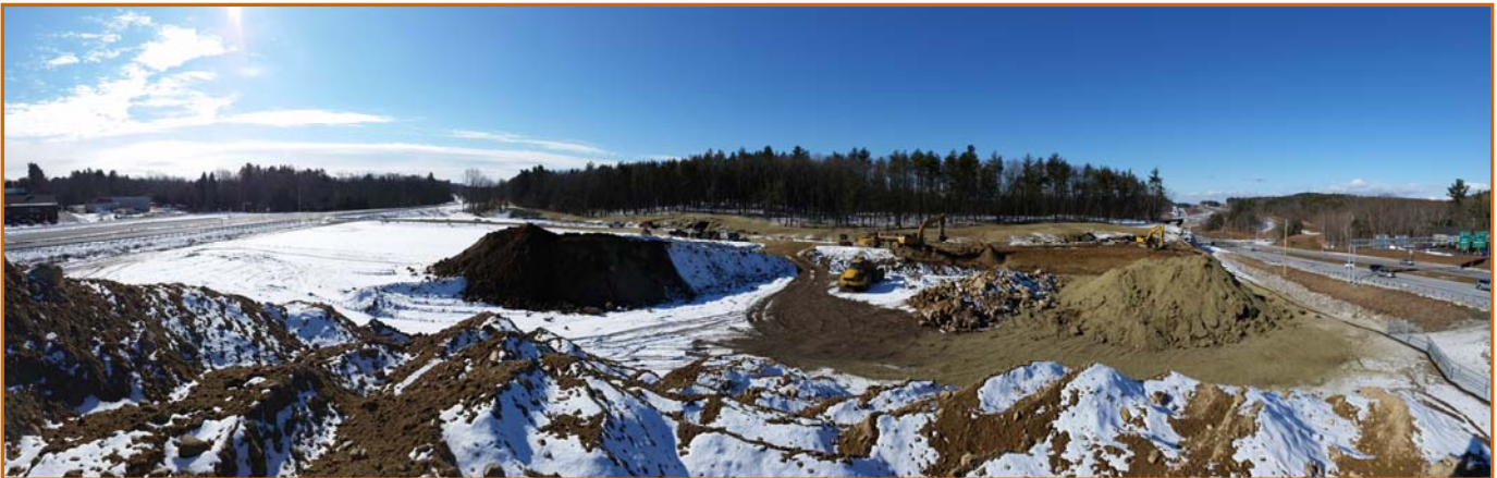
BELOW: SITE WORK AT THE NEW PARK AND RIDE AREA