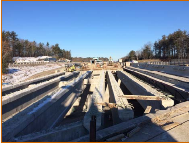
NB NORTH LOWELL RD BRIDGE WORK.