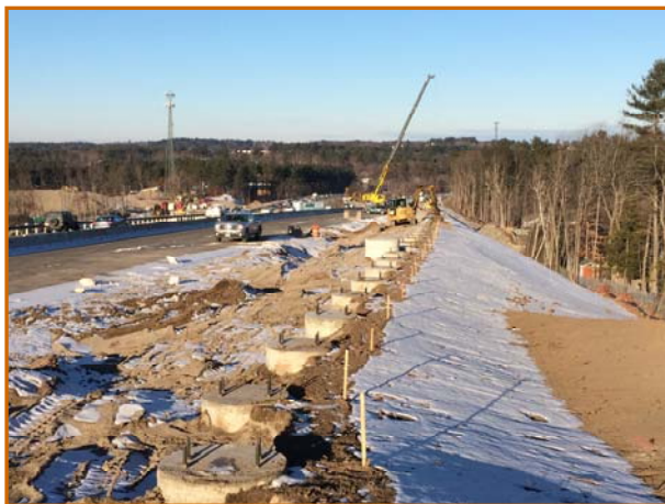
NB SOUNDWALL BASES, FACING NORTH.