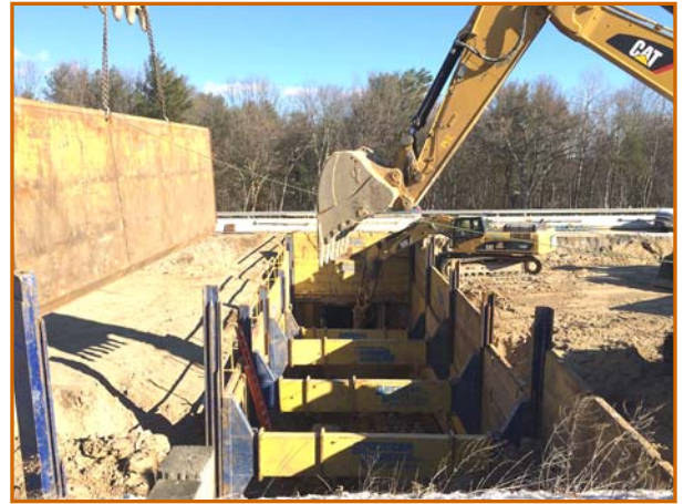
REC TRAIL BOX CULVERT CONSTRUCTION IN MEDIAN