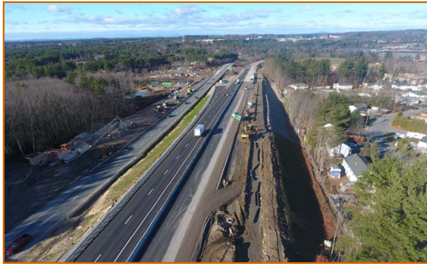
I-93, NEW AND OLD, FACING SOUTH.