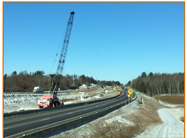
NEW NB ALIGNMENT, FACING NORTH.