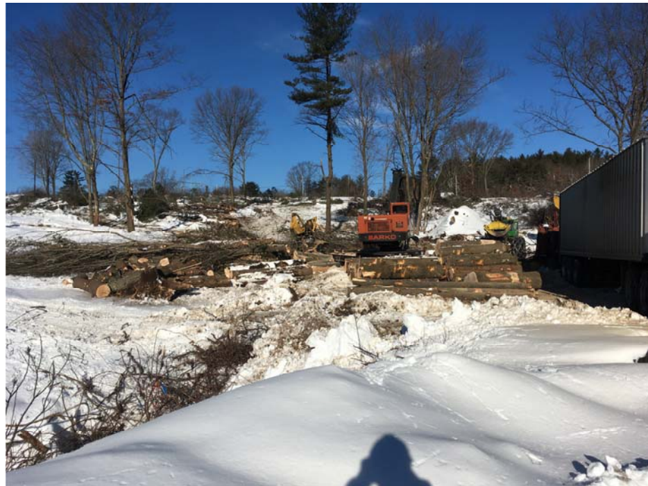
CLEARING FOR EXIT 4 SB RAMP AND MAINLINE.