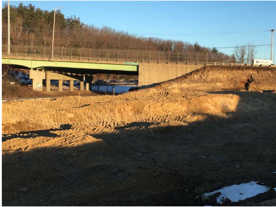
EXISTING NH ROUTE 102 BRIDGE AT EXIT 2, WITH EXCAVATION FOR NEW BRIDGE.