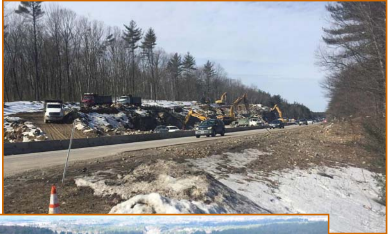
RIGHT: SOUTHBOUND I-93 LEDGE EXCAVATION