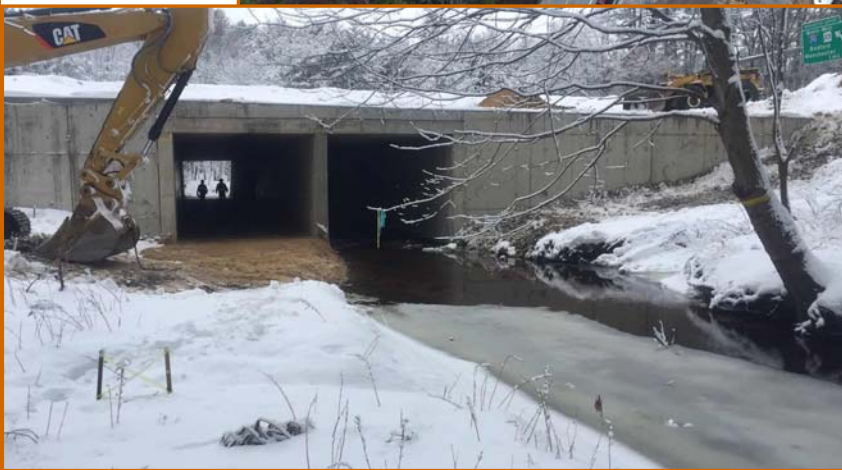
LEFT: NORTHBOUND COHAS BOX CULVERT EXTENSION