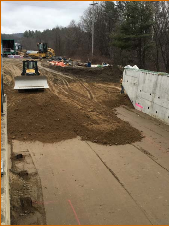
ABOVE: SB NORTH LOWELL ROAD BRIDGE BACK-FILLING