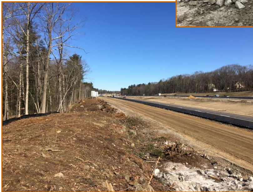
LEFT: SB PAVEMENT REMOVED, TREES CLEARED AND GRUBBED, FACING NORTH