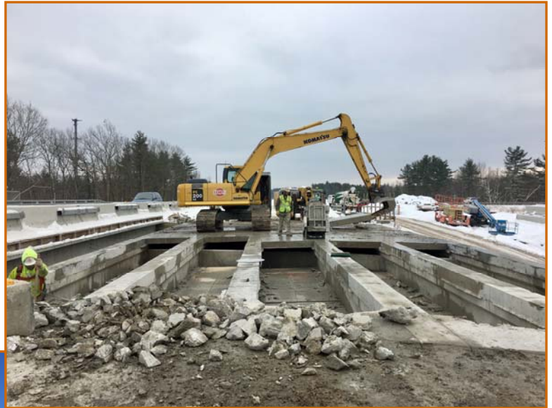
RIGHT: NB STONEHENGE ROAD BRIDGE DECK REMOVAL, FACING SOUTH