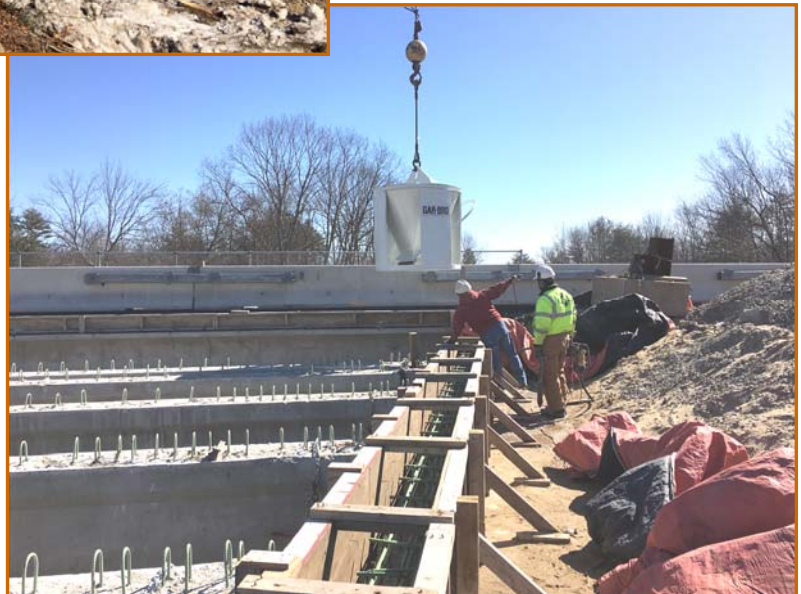
RIGHT: NB BRIDGE OVER STONEHENGE ROAD BACKWALL POUR FOR EXISTING BRIDGE