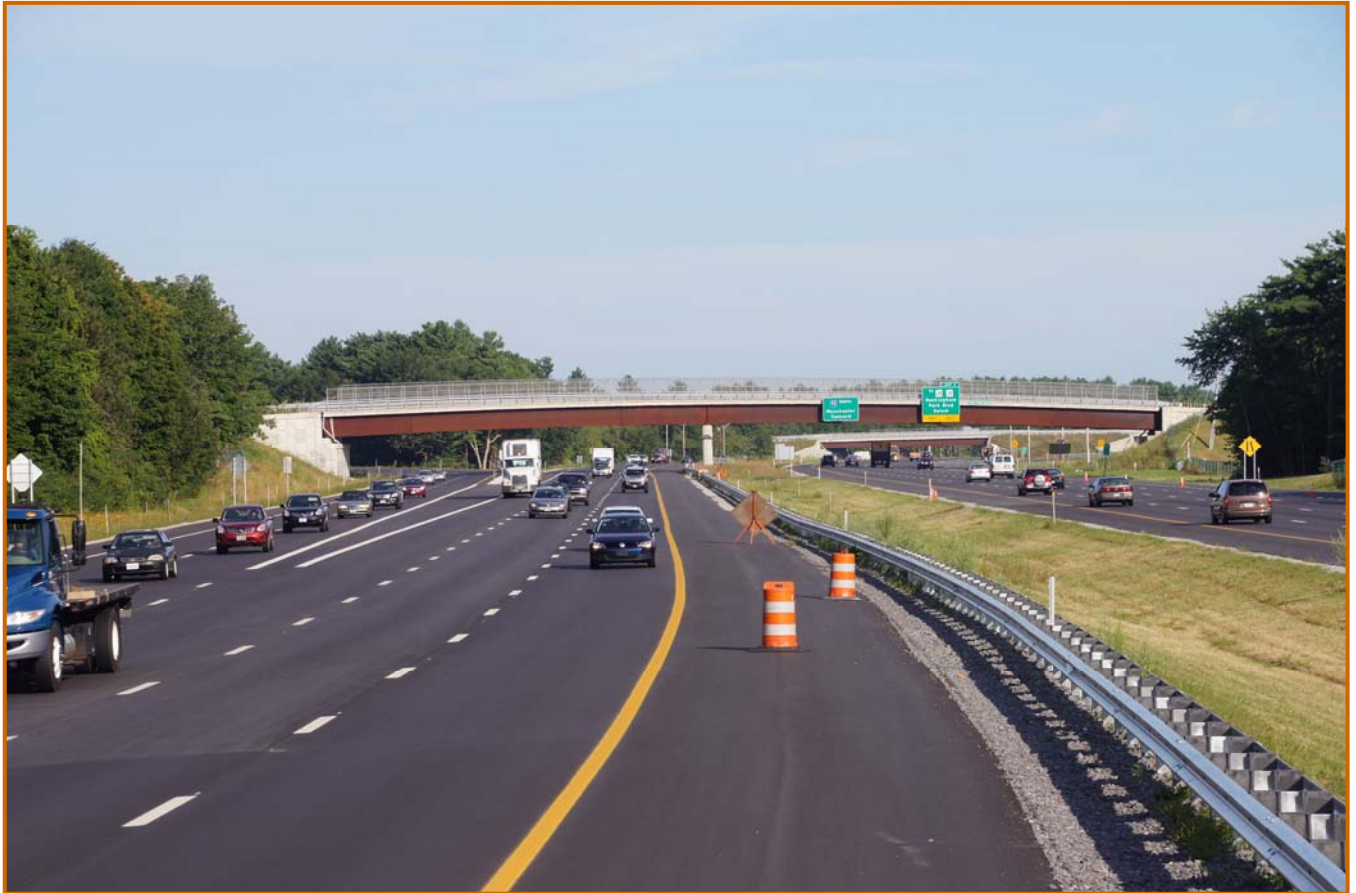
VIEW OF COMPLETED SB AND NB IN THE AREA JUST SOUTH OF EXIT 1 (LOOKING NORTH - SB ON LEFT AND NB ON RIGHT)