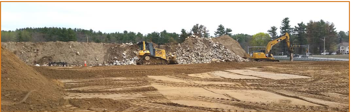
BELOW: SITE WORK AT THE NEW PARK AND RIDE AREA