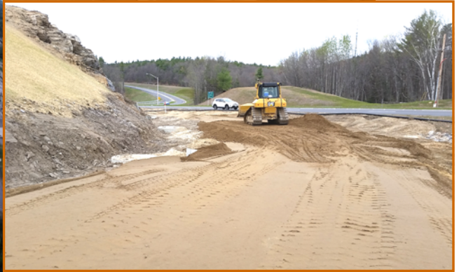
ABOVE: CLOCKWISE FROM TOP LEFT: PARKING AREA LIGHT POLES ARE INSTALLED; DRONE AERIAL OF THE PARK AND RIDE FACING EAST; EARTHWORK IN MAY; DRONE AERIAL SHOWING ENTIRE PARK AND RIDE SITE, FACING NORTH.