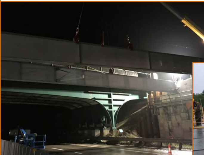
LEFT: ASH STREET/PILLSBURY ROAD BRIDGE STRUCTURAL STEEL IS SET.