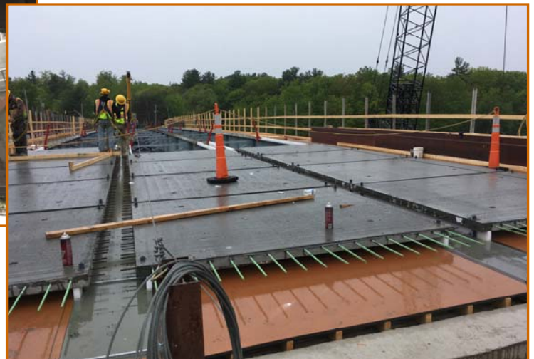
RIGHT: PLACEMENT OF NH ROUTE 102 BRIDGE DECK PANELS