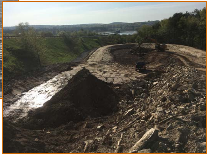
RIGHT: DRAINAGE INSTALLATION UNDERGOES CONSTRUCTION.