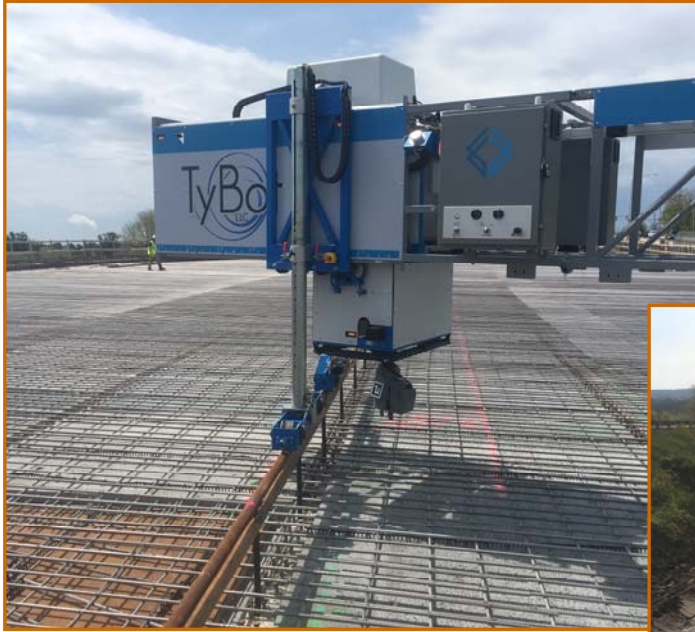
LEFT: A TYBOT TIES REINFORCING STEEL ON NH ROUTE 102 BRIDGE .