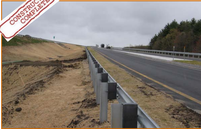
Looking North Along the New NB On-Ramp 04-28-2010