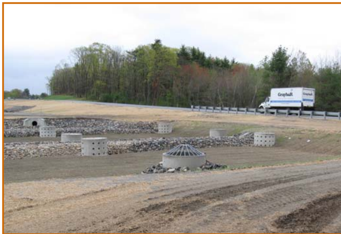
STORMWATER TREATMENT SOLUTIONS