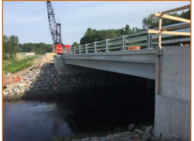
NB BEAVER BROOK BRIDGE