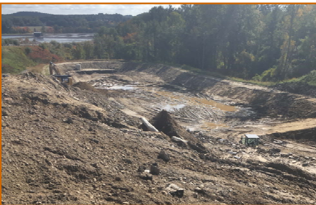
CONSTRUCTION OF WATER QUALITY BASIN