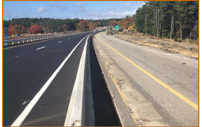
NB TRAFFIC SHIFT AT EXIT 4