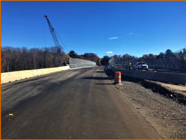
ASH STREET BRIDGE OPENS TO TRAFFIC.