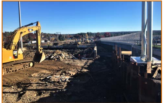
ROUTE 102 BRIDGE DEMOLITION