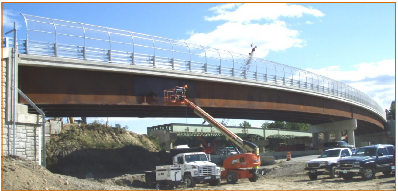
New Cross Street Bridge opened to traffic August 21, 2008.