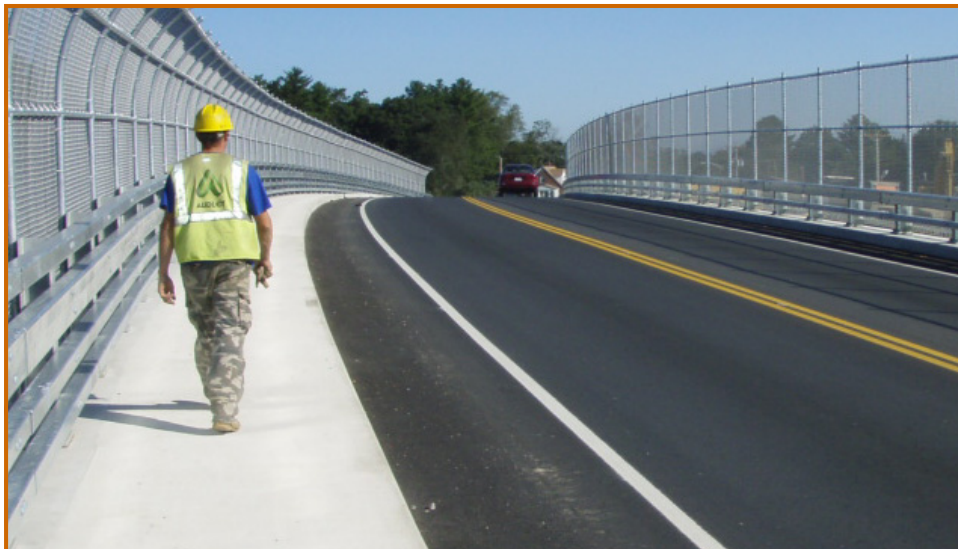
New Cross Street Bridge ~ September 2008